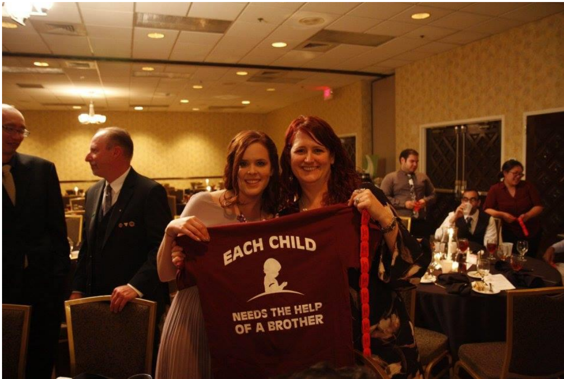
TAC Brothers check out sweet raffle prizes at the Banquet