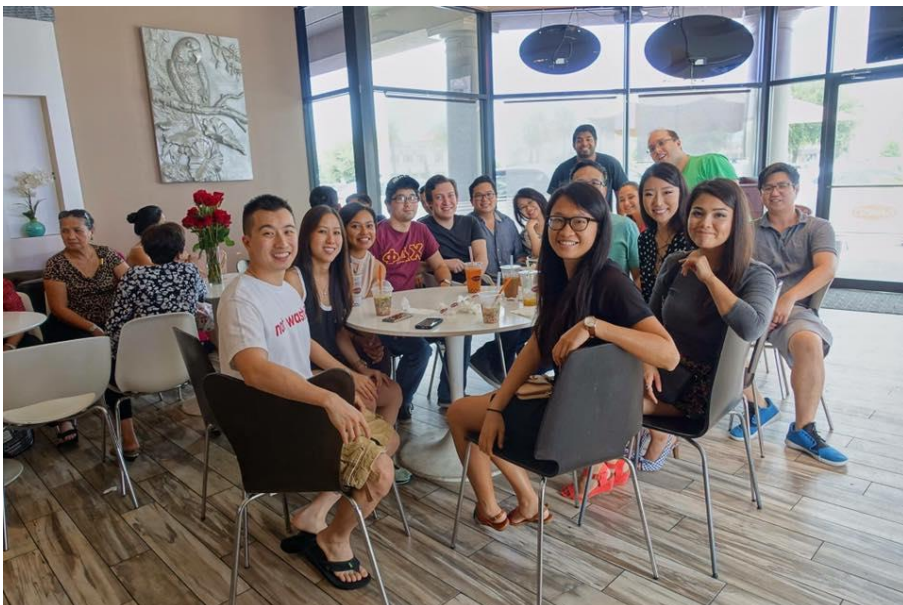
Gamma Epsilon Alumni Gathering