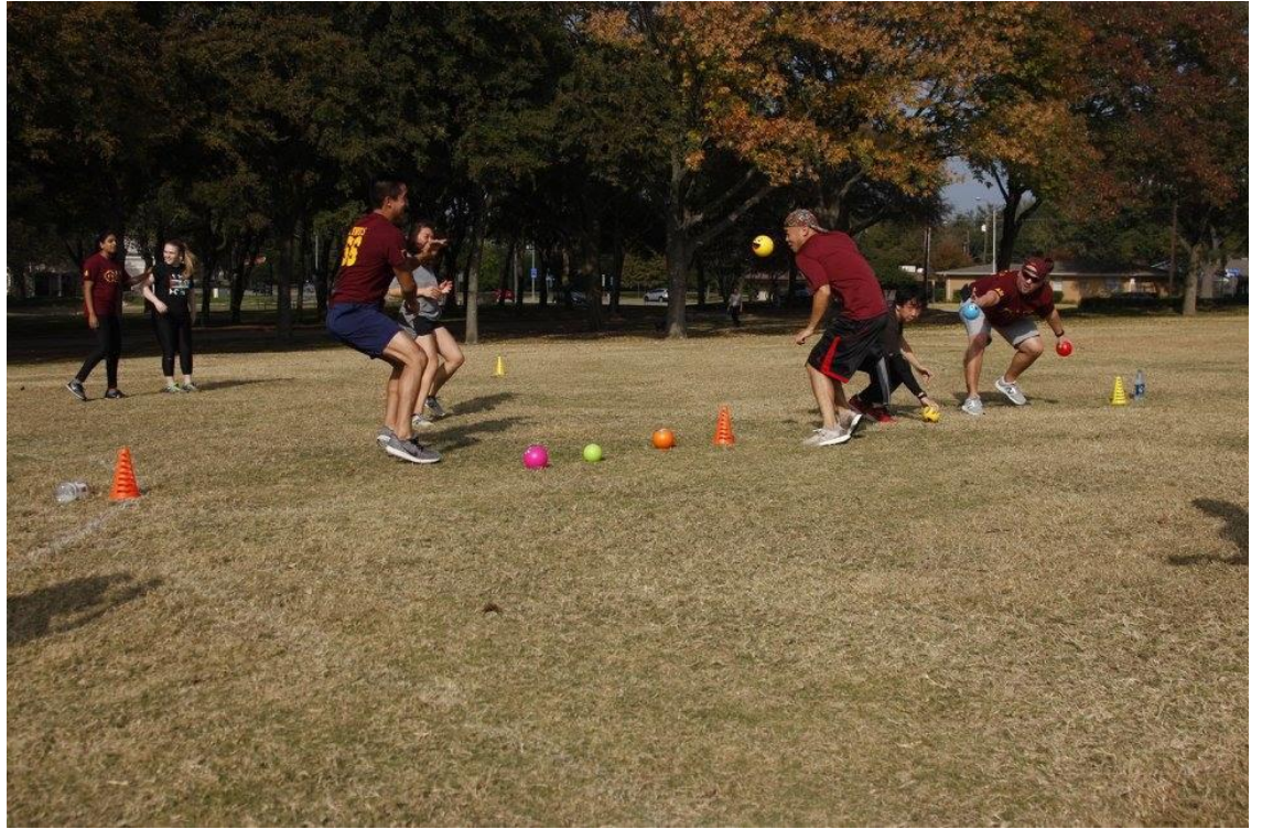
Founder's Day Field Day