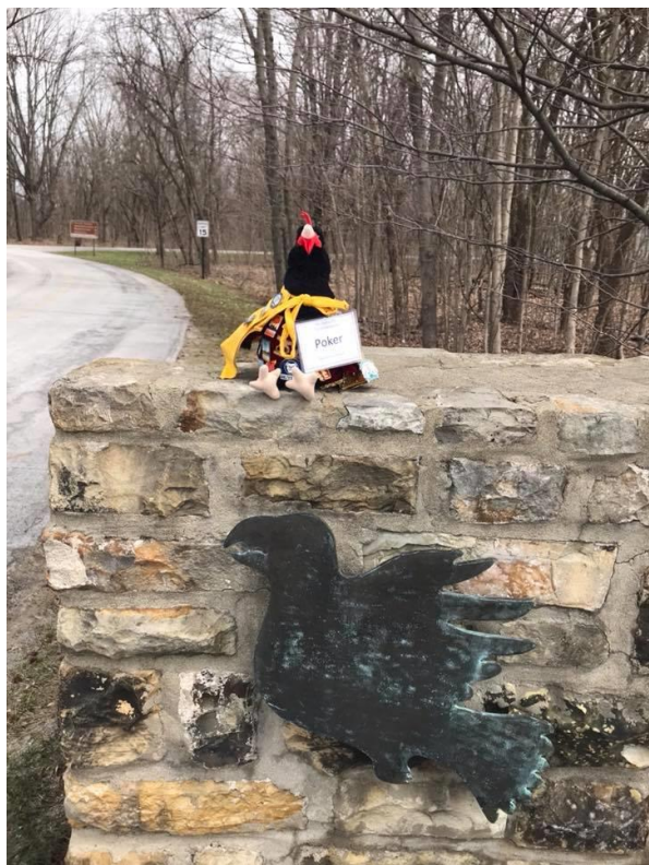
We still have Poker, Checkmate EC