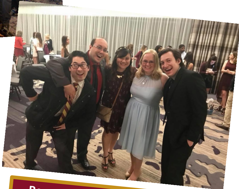
Representin' at Southcentral Regional Conference 2018